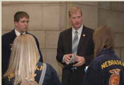
A group of students meet with their state senator to discuss important ag topics during the Ag Issues Academy held during the Nebraska State FFA Convention.