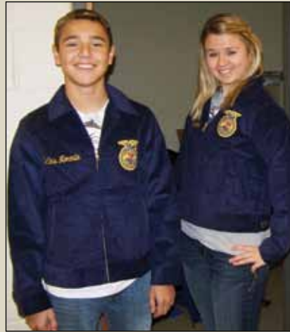
Students from the Southern Valley FFA Chapter show off their new jackets that were presented last fall as part of the Jacket Fund.

Please consider supporting the Jacket Fund today so we're prepared to award jackets this fall. Thank you!